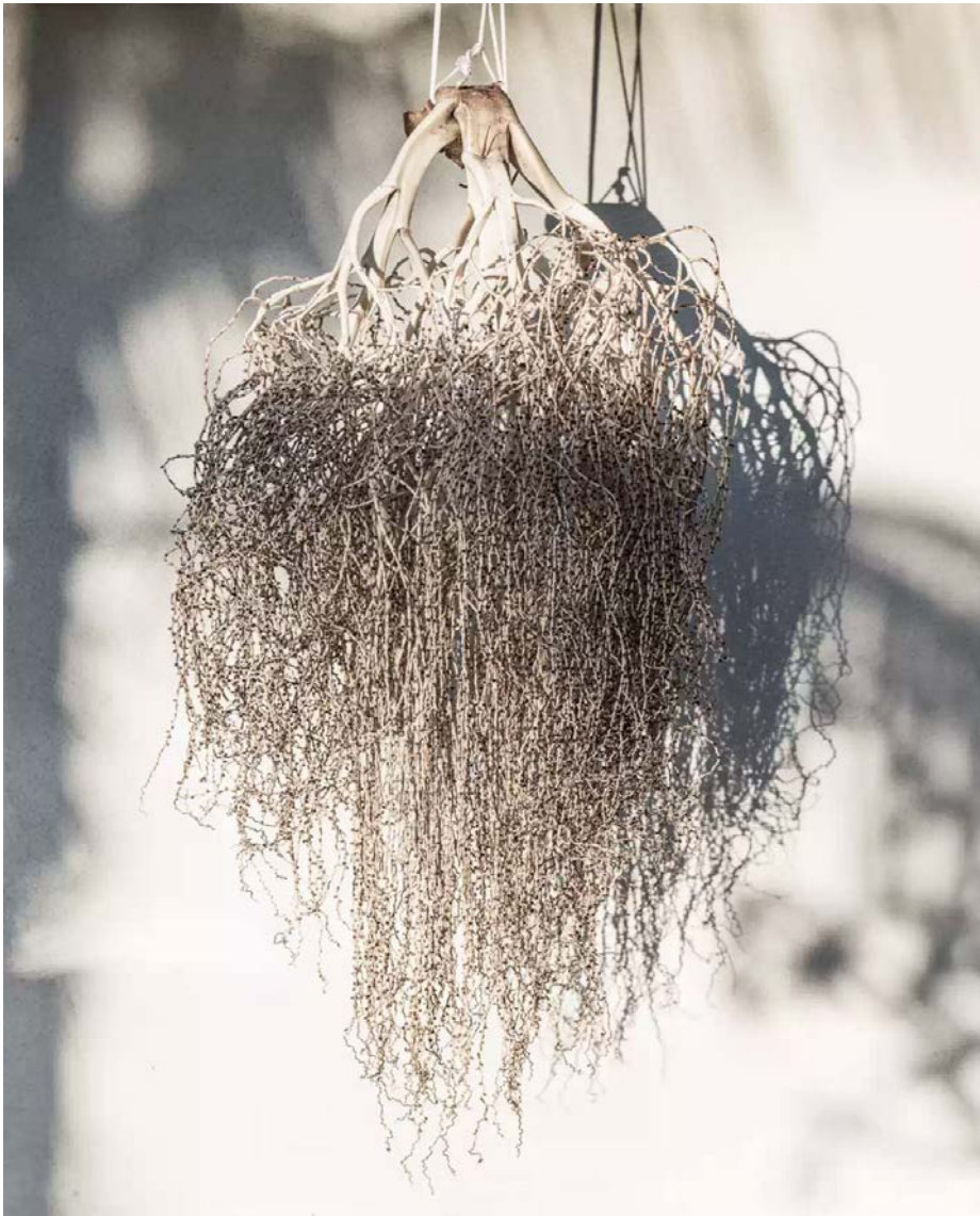
Amir Zaki, Expanded Flower