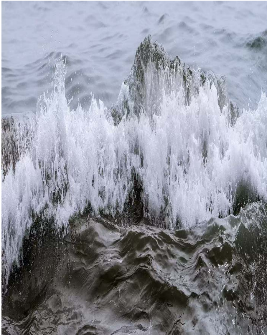
Amir Zaki, Sliver 7