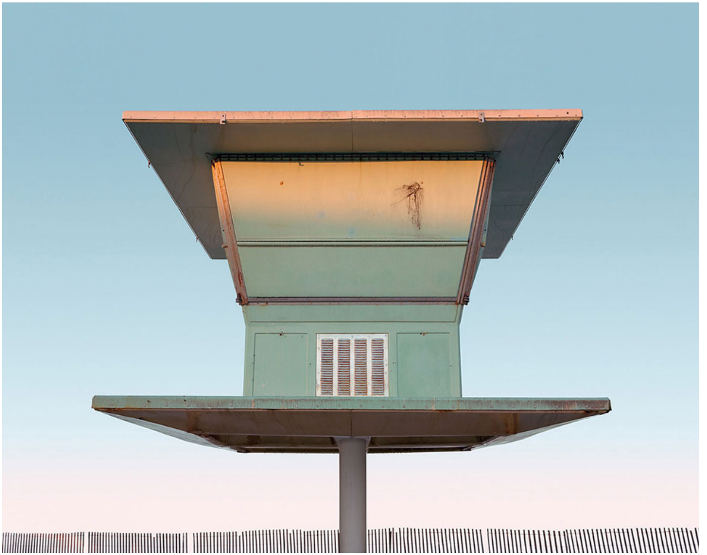
Amir Zaki, Untitled (Tower 19), 2009