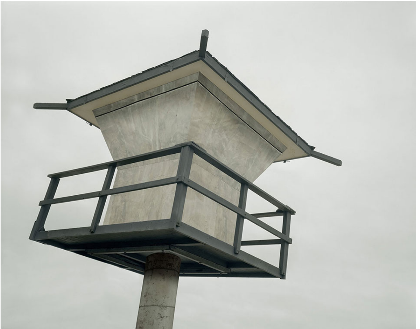
Amir Zaki, Untitled (Tower 9), 2009