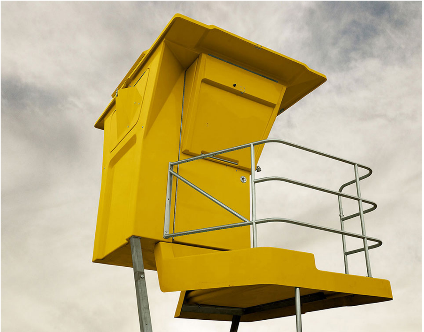
Amir Zaki, Untitled (Tower 42), 2009