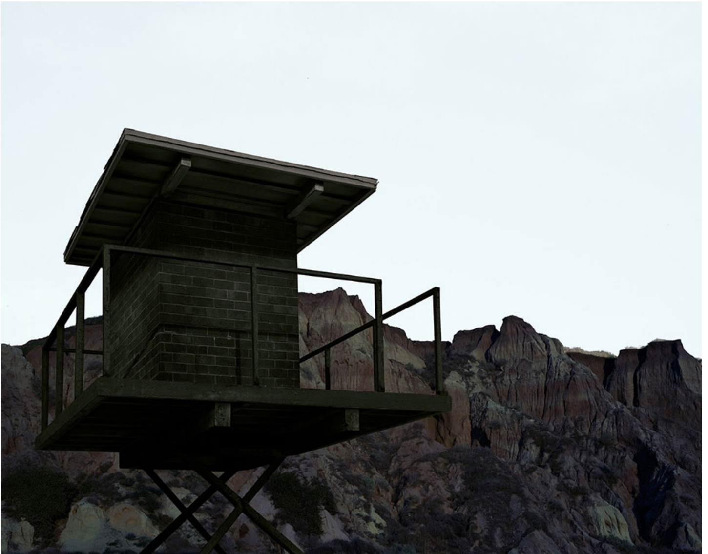
Amir Zaki, Untitled (Tower 63-64), 2009