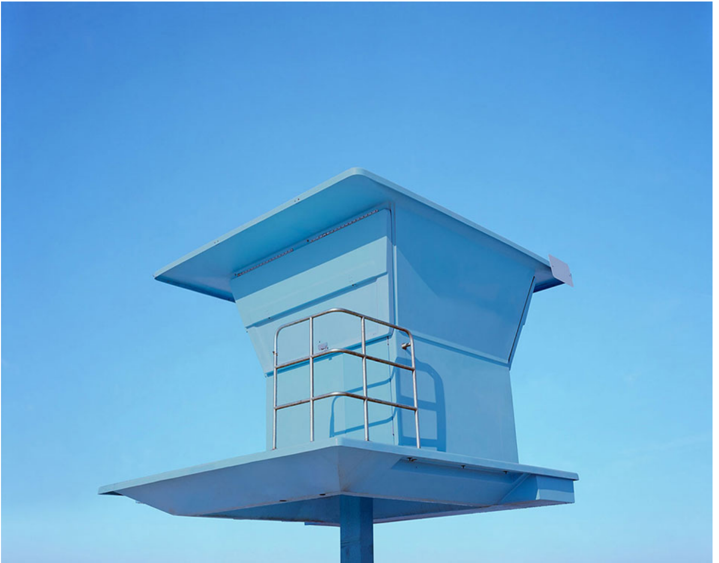
Amir Zaki, Untitled (Tower 30), 2009