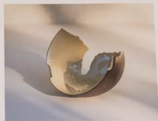
Broken Shell Los Angeles, California