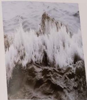
Rock of the Future Los Angeles, California