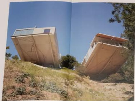
House of the Future Los Angeles, California