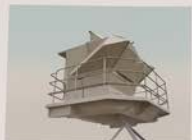
Architectural rendering of Theater of the Future