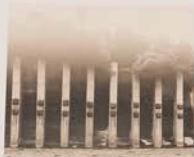
Architectural rendering of Theater of the Future