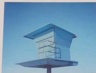
Architectural drawing of a modern structure.