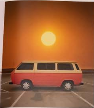
© 2011 Volkswagen Group of America