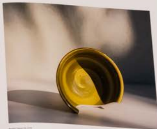
Architectural rendering of Theater of the Future