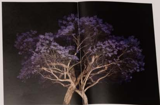
© 2011 Volkswagen Group of America