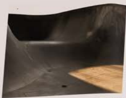
Interior view of the Theater of the Future