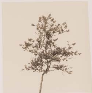
The Theater of the Future