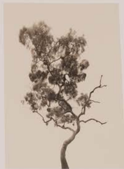
Black and white photograph of a tree.