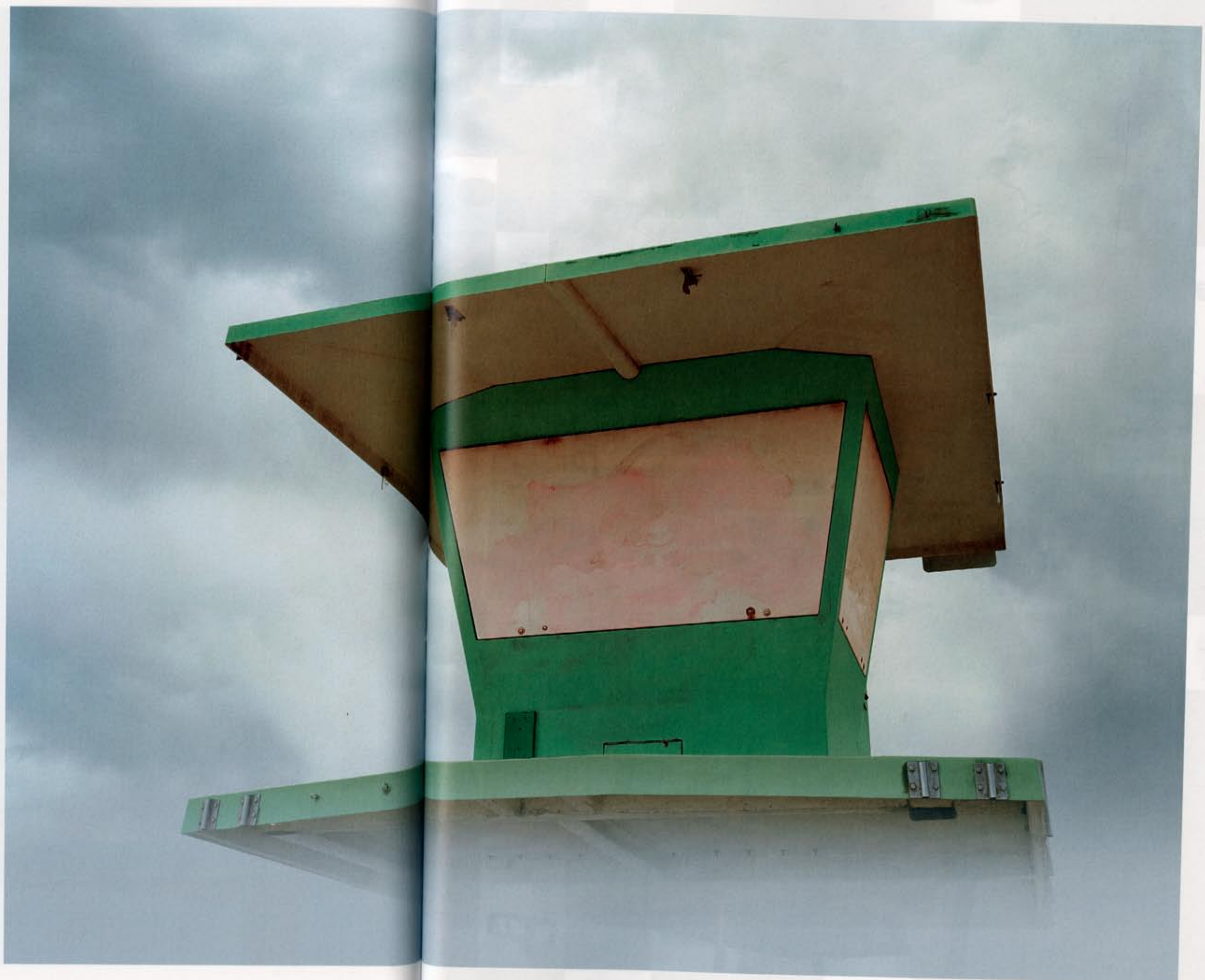
Untitled (Tower 6), 2009