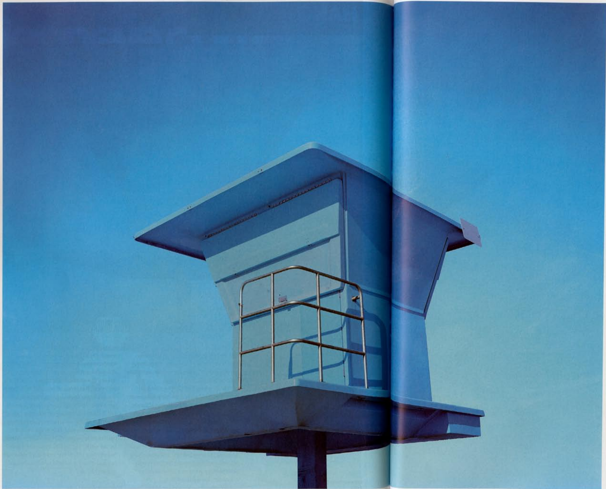
Untitled (Tower 30), 2009