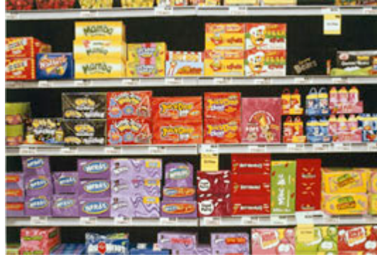
Cindy Craig, "Candy," 2004, watercolor on paper, 38 1/4 x 51".

An upside of the unforgiving medium of watercolor is that it can be used to create mysterious surfaces that play well against the literalness of photo realism. Such is the tension in large scale (5-6 feet) works by Cindy Craig . She captures the insides of our favorite hangouts: discount retailers with row upon row of products and ambling shoppers, or fancier type department stores with their high ticket cosmetics.