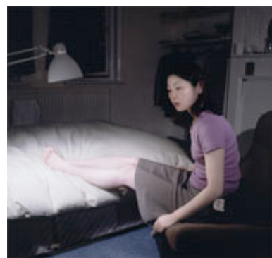
Shizuka Yokomizo, "Untitled (Hitorigoto)," 2002, 13 x 13 3/4", digital C-type print.

Despite the diversity of media, from painting to video to various forms of public art, including Hiroshi Fuji's recycled toy collaboration with the children of San Ysidro and Cai