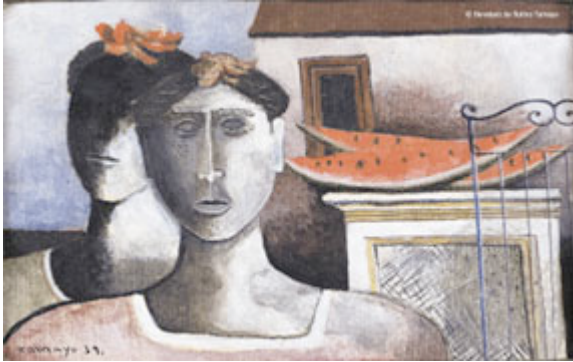
Rufino Tamayo, "Women of Tehuantepec," 1939, gouache on canvas, 5 x 7".

A small but fascinating survey of Rufino Tamayo's paintings and prints displays the mastery of color and ancient imagery practiced by the late Mexican master. Tamayo revered Mexico's rich heritage of Pre-Columbian and folk art. Among the most striking pieces are the many Mixografía prints, a technique originated by printer Luis Remba. According to Remba, "The method allowed the artist to create a collage or maquette out of various materials, such as charred wood, rope, cotton and other natural substances which we would then cast in copper as a printing plate."