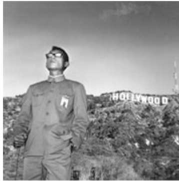
Tseng Kwong Chi, "Hollywood Hills, California," 1979, silver gelatin print.

Although born in Hong Kong in 1950, Tseng Kwong Chi has spent most of his artistic career in New York. He was the photographer who documented many of Keith Haring's performances, as well as those by other artists associated with the East Village scene. By what we see here, there is also a performance element in his own work. In 1979 Tseng dressed up as a mysterious Asian Ambassador wearing a Mao uniform, sunglasses and official visitors photo ID. He began to photograph himself in this costume in front of recognizable monuments such as the World Trade Center, the Statue of Liberty, the Grand Canyon, as well as in numerous international locations.