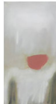
Janet Rosener, "Untitled, Catalog No. 15604," 2004, oil on Italian cotton over panel, 21 x

Janet Rosener gives voice to her attraction to Buddhist philosophy through ethereal Zen-like oil on canvas paintings. A series of small, untitled and washy images, created more through reduction than addition, is her way of expressing beauty in its most serene and minimal form. Using an iridescent silver paint along with encaustics, each painting exudes a scumbled wetness, contrasted by mystically dark umber silhouettes. The work does not reference nature but effects a quiet sense of natural entities whether sky, mist, forest, or ocean waves. Rosener's soft application of paint creates timeless images and meditative atmospheres