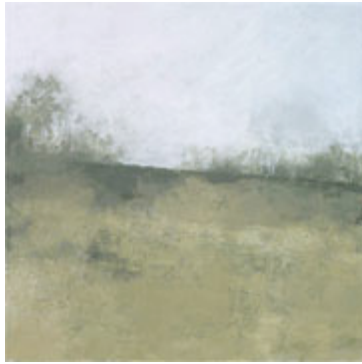
June Harwood, "Siege", 2002, acrylic on canvas, 50 x 50 inches.

Hard edge abstraction is what June Harwood has been associated with for decades, so the appearance of even a subtle shift in aesthetic is cause for comment and reflection. Thus dual color masses modulated by active brushwork and the suggestion of a horizon line explode into landscape and even narrative associations that initially seem out of character. But this injection of personality and subjectivity has to be regarded as a bold risk, and therefore significant given the late stage of an already notable career ( Louis Stern Fine Arts , West Hollywood).