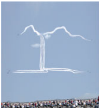
Cai Guo-Qiang, "Painting Chinese Landscape Painting," digital rendering of proposal for Miramar Air Show day program. Performed October 15, 2004, Six T-34 skywriting propeller planes.

To imagine James Richards' works, think of a very open, almost expressionist cross hatched lattice of yarn or twine strung across a hollow rectangle. Then imagine an artist applying thick, oozy pigment on this lattice here and there to suggest an abstract pattern or some random flora or seed pod. The rest of the image--and there is no real image per se--is hinted at by bands of yarn and bright twine randomly coiled around the stringed infrastructure. Yarn bunches and opens, lines up and expands, ebbs onto the edge of thick painted sections. You can always see through the panels into the supporting wall. Richards is at times unabashedly decorative, but uses the stuff of "low" craft to create sophisticated, enchanting works ( Shoshana Wayne Gallery , Santa Monica).