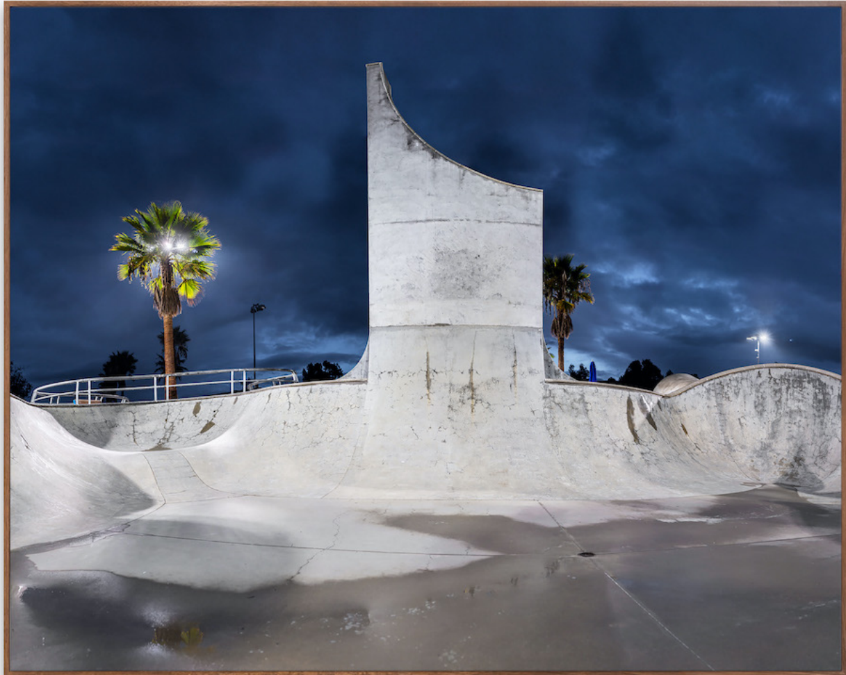
Amir Zaki, Concrete Vessel 71 , 2019. Courtesy of the artist.

long length of the pier as I crossed over sand and then sea to the circular endpoint and the expansive view of the ocean. From that position on the pier it is impossible to see its supports, whereas from the beach or at the shoreline, the pier's top is invisible and the understructure becomes foregrounded. This duality is at the root of Zaki's project. In previous bodies of work, Zaki explored the natural landscape as well as vernacular architecture of Southern California, shooting hundreds of images with Gigapan technology that allows him to digitally stitch them together into the final scene. For Empty Vessels (2019), he photographed skateboard parks emphasizing their bunker-like architecture as vast, empty, concrete spaces with curiously sensuous and curvy mounds. In Getting Lost (2018), he created mysterious and evocative photographs of what appeared to be conversations among illuminated trees at night. Other series include manipulated photographs of elevated lifeguard towers and impossibly cantilevered buildings jutting out of hillsides and cliffs.