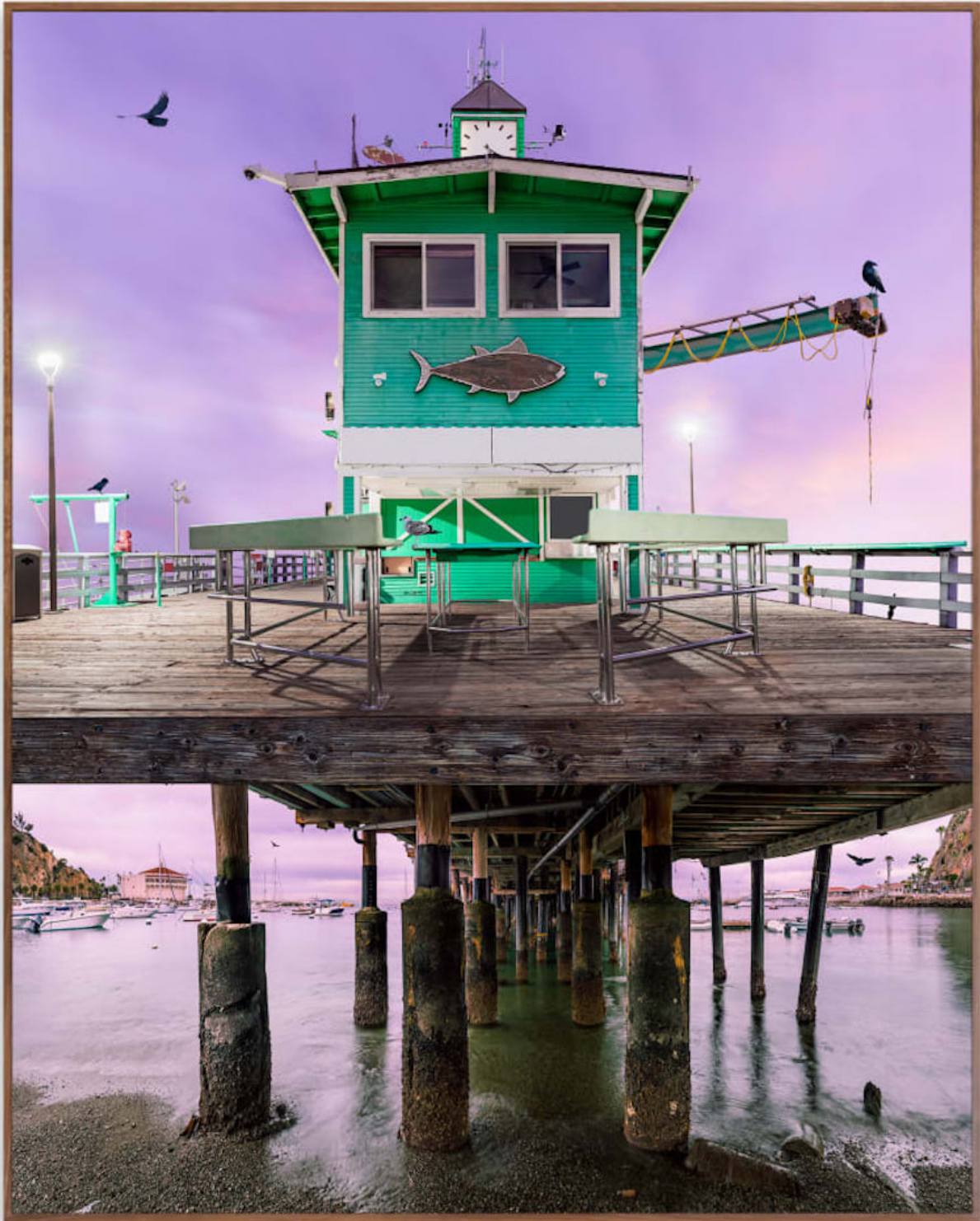
Amir Zaki, Built in 1906. Damaged in 1908. Renovated in 1907, 1909 X, 2021. Courtesy of Diane Rosenstein Gallery.