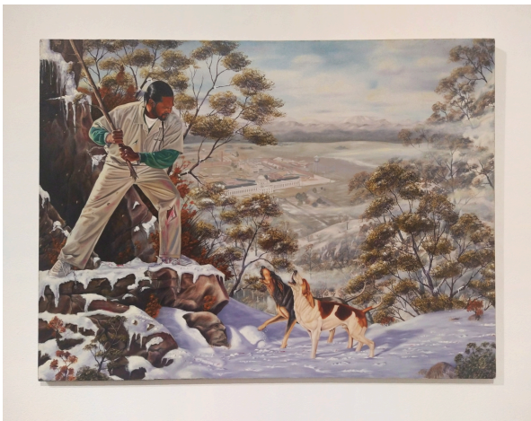
MR. WASH: 'MR. WASH'