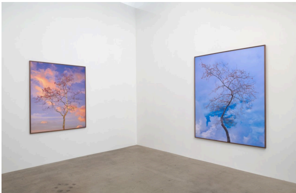
AMIR ZAKI: 'NOTHING TO SAY'