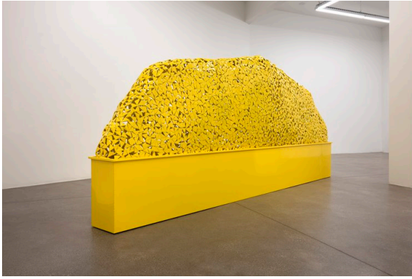
RACHEL LACHOWICZ: 'THE GRAVITY OF COLOR'