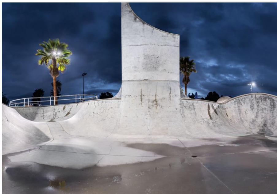
Lake Cunningham Regional Skatepark, San Jose.