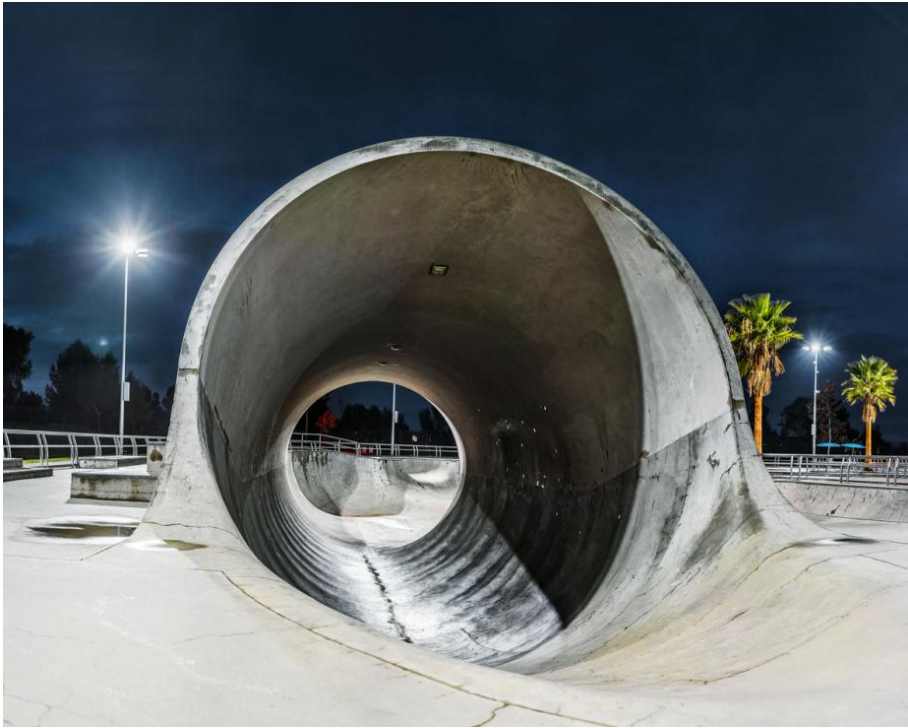
Lake Cunningham Regional Skatepark, San Jose.