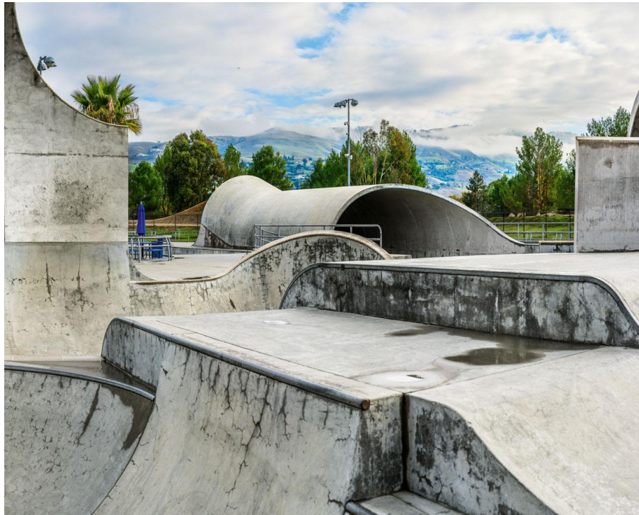
Lake Cunningham Regional Skatepark, San Jose.