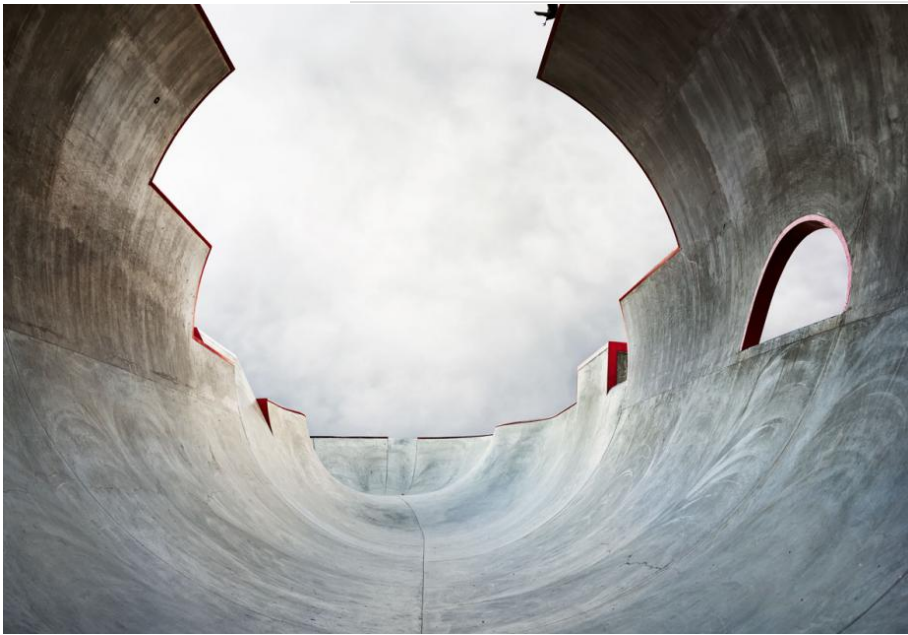
Linda Vista Skatepark, San Diego.