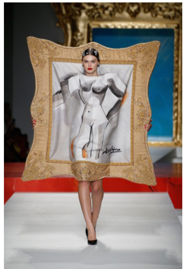
The Moschino runway show during Milan Fashion Week.