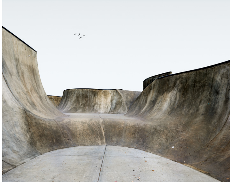
Concrete Vessel 4 , 2018, 36" x 45", archival pigment photograph