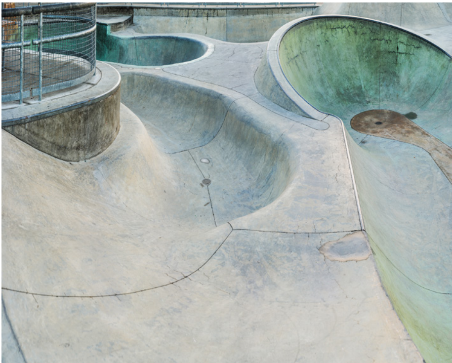
Concrete Vessel 118, 60" x 75", 2018, archival pigment photograph