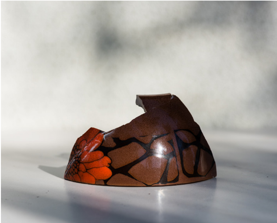
Broken Vessel 29 , 36" x 48", 2018, archival pigment photograph