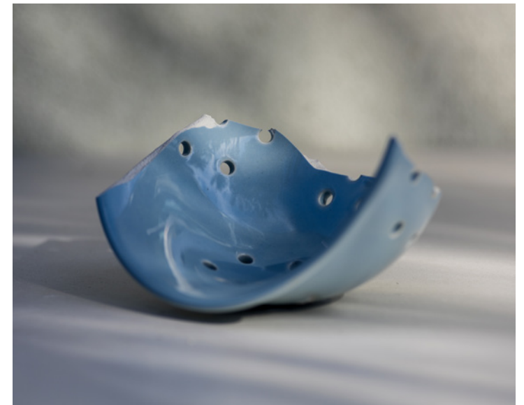
CLOCKWISE FROM TOP LEFT: Concrete Vessel 49 , 48" x 60", 2018, archival pigment photograph Broken Vessel 40 , 48" x 60", 2018, archival pigment photograph Concrete Vessel 130 , 24" x 30", 2018, archival pigment photograph Broken Vessel 74 , 24" x 30", 2018, archival pigment photograph Broken Vessel 22 , 48" x 60", 2018, archival pigment photograph Concrete Vessel 10 , 48" x 60", 2018, archival pigment photograph