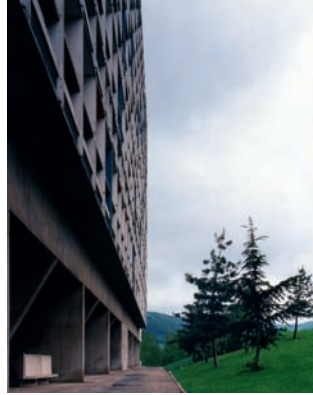
Arni Haraldsson West façade, Unité d'habitation , 1999 © o artista / the artist / l'artiste