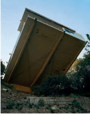
Amir Zaki Sem Título/Untitled (Spring Through Winter) , 2005 © o artista/the artist/l'artiste