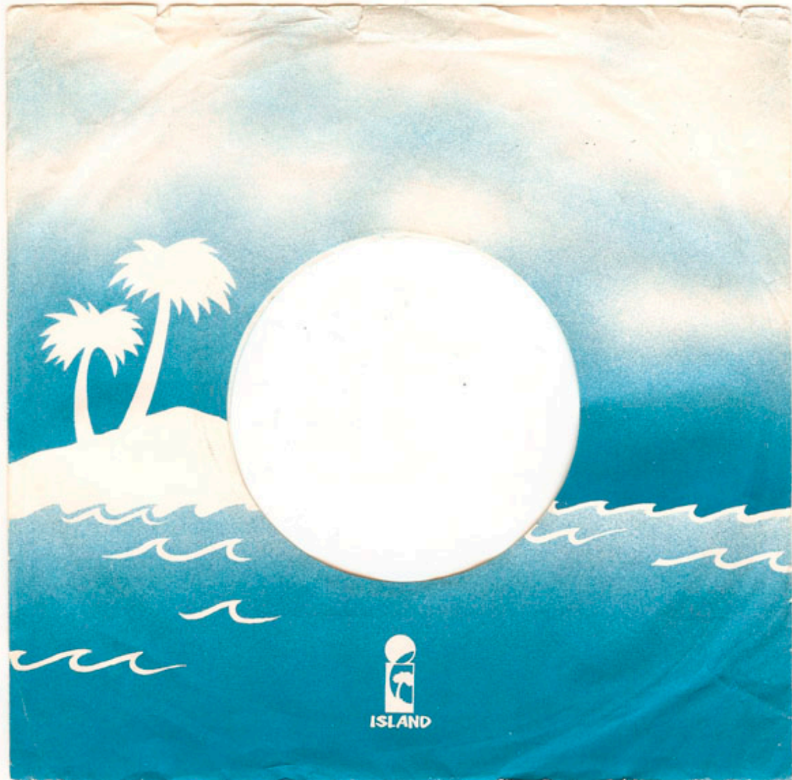
Matthew Smith, Typical Affair (detail), 2006 Painted shelf and bracket and screws with Island Records 7" record sleeve 27 by 29 by 5.5 inches

From: Western Bridge <info@westernbridge.org> Subject: "Underwater" Opens May 21 - Western Bridge Turns 5 Date: June 4, 2009 2:33:33 PM PDT To: amirzaki@verizon.net Reply-To: info@westernbridge.org