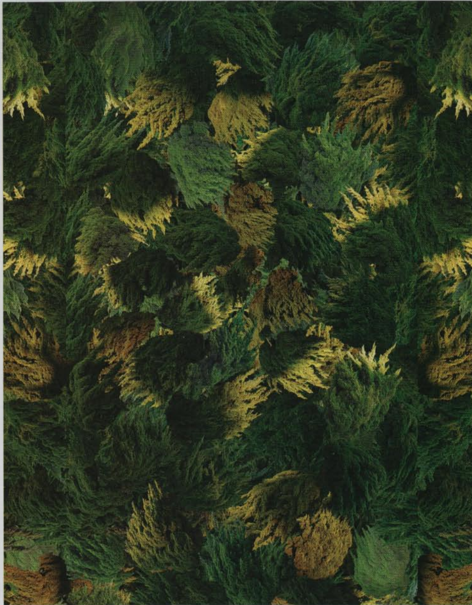
Opposite Page: Meditations on the Hollywood Juniper , 2008, high definition video and photographs, dimensions variable (installation detail above)

Born in Beaumont, California, 1974 Lives in Huntington Beach, California